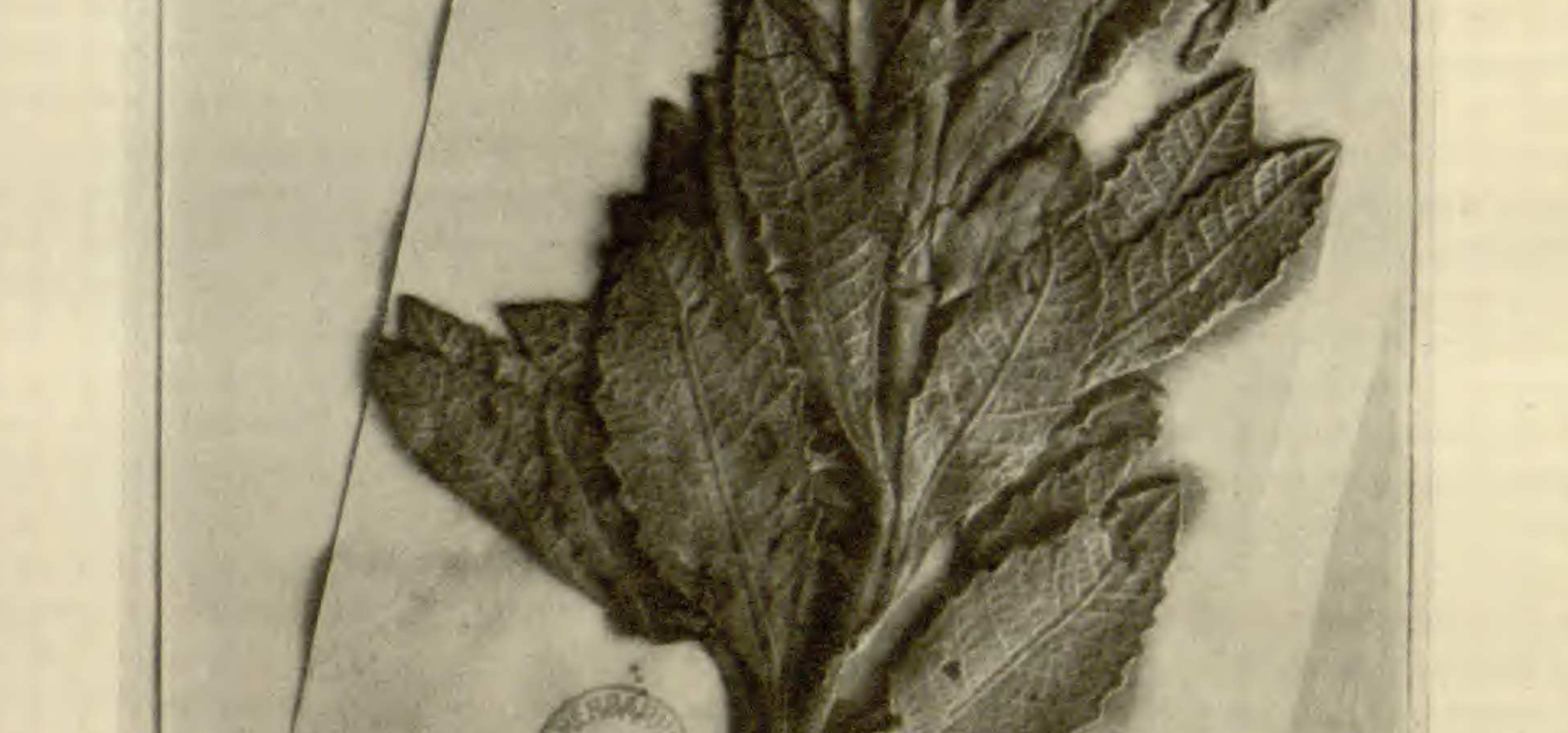
FIG. 2.—Eriodictyon tomentosum Benth.: type specimen in the Bentham Herbarium at Kew Gardens.